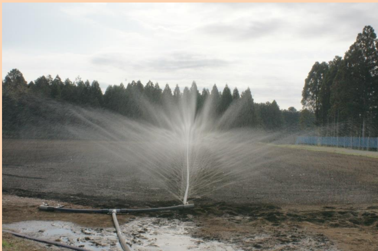
Pressure and Spray Coverage

We improve cultivation efficiently and crop quality, together with you.